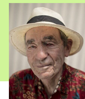
Sincerely, Albie Sachs Former Justice of the Constitutional Court of South Africa