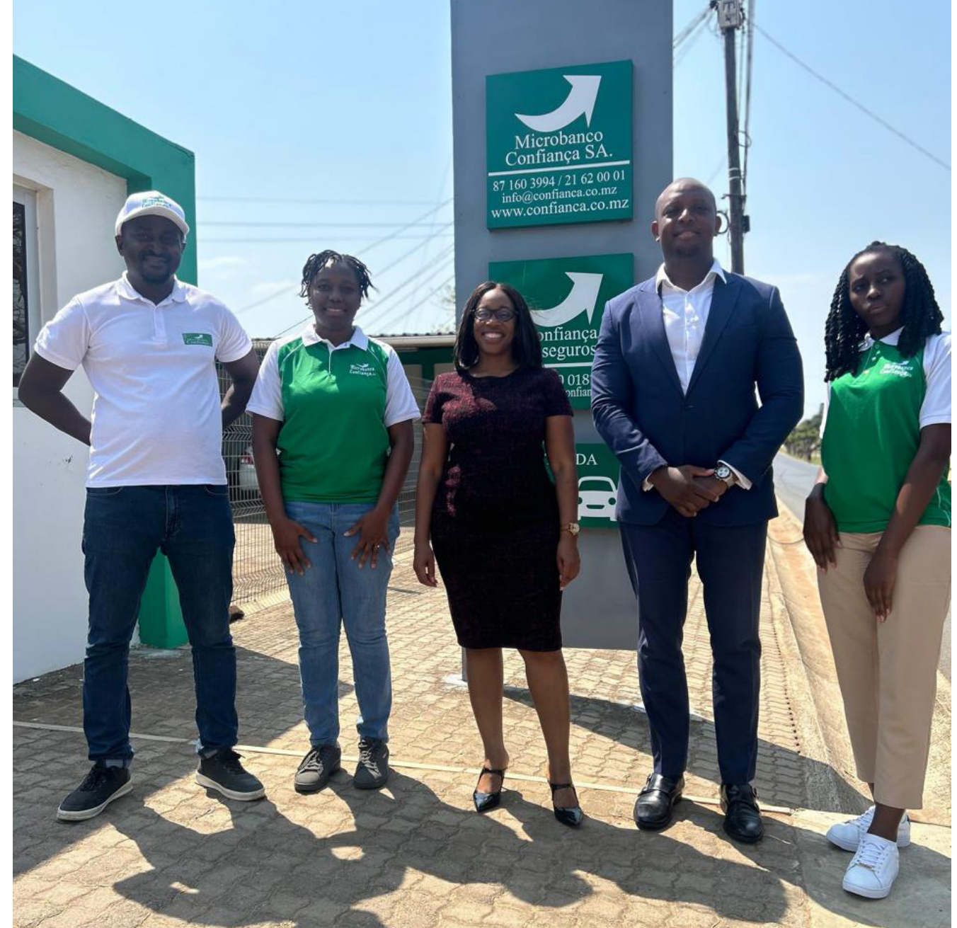
SHARED INTEREST INITIATED PARTNERSHIP DISCUSSIONS WITH MISSION-ALIGNED FINANCIAL INSTITUTIONS SUCH AS MICRO BANCA

Shared Interest has proven its own resilience—emerging from the challenges of a global pandemic and navigating the uncertainties of shifting political landscapes, including a new U.S. presidency. Despite the turbulence, the organization has remained focused and forward-looking, accelerating progress toward its goal of reaching 100,000 beneficiaries by the end of 2025. In countries where resilience already runs deep, Shared Interest's model doesn't just offer access to finance—it offers the tools to thrive in uncertain times.